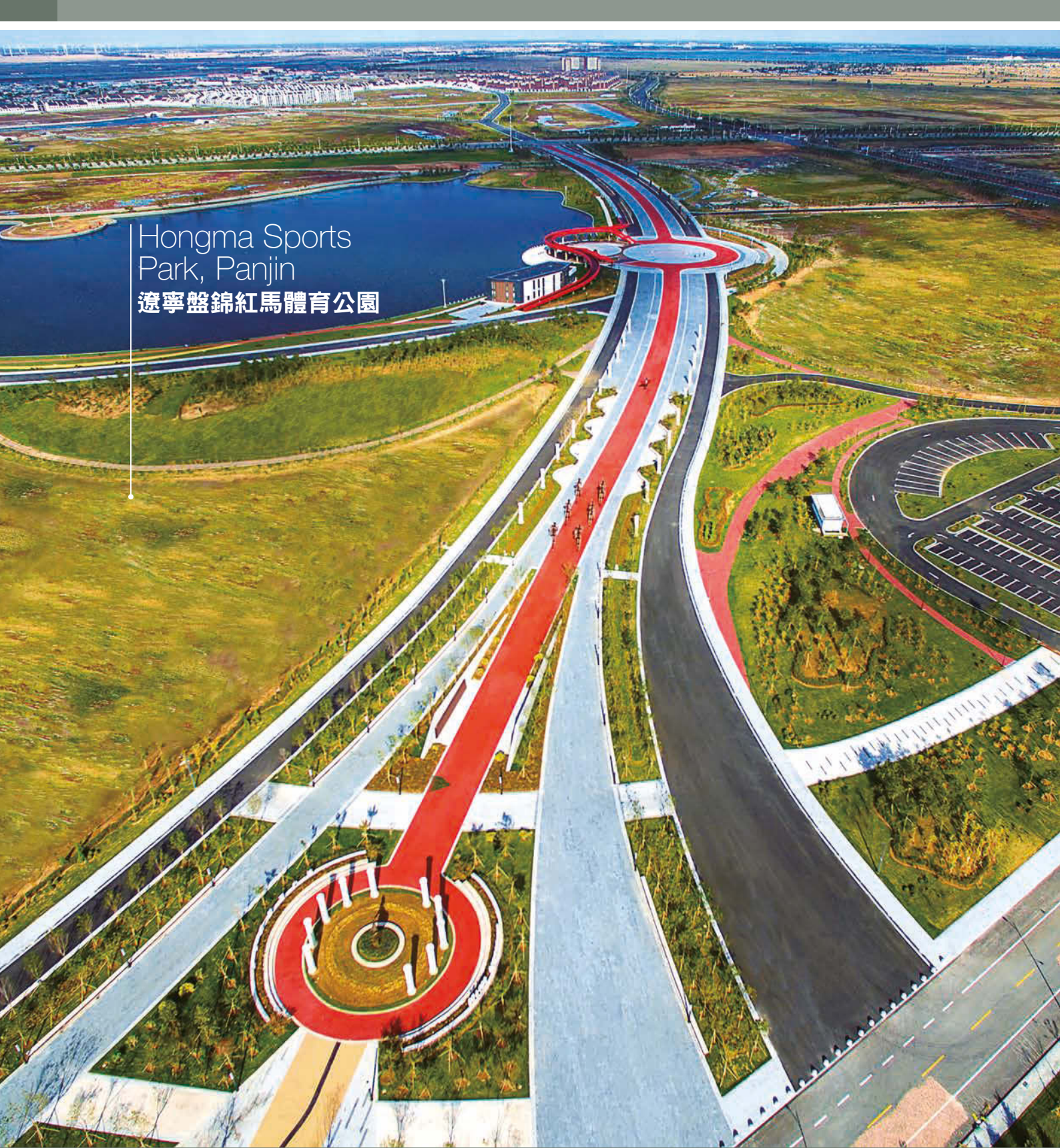
Hongma Sports Park, Panjin 遼寧盤錦紅馬體育公園